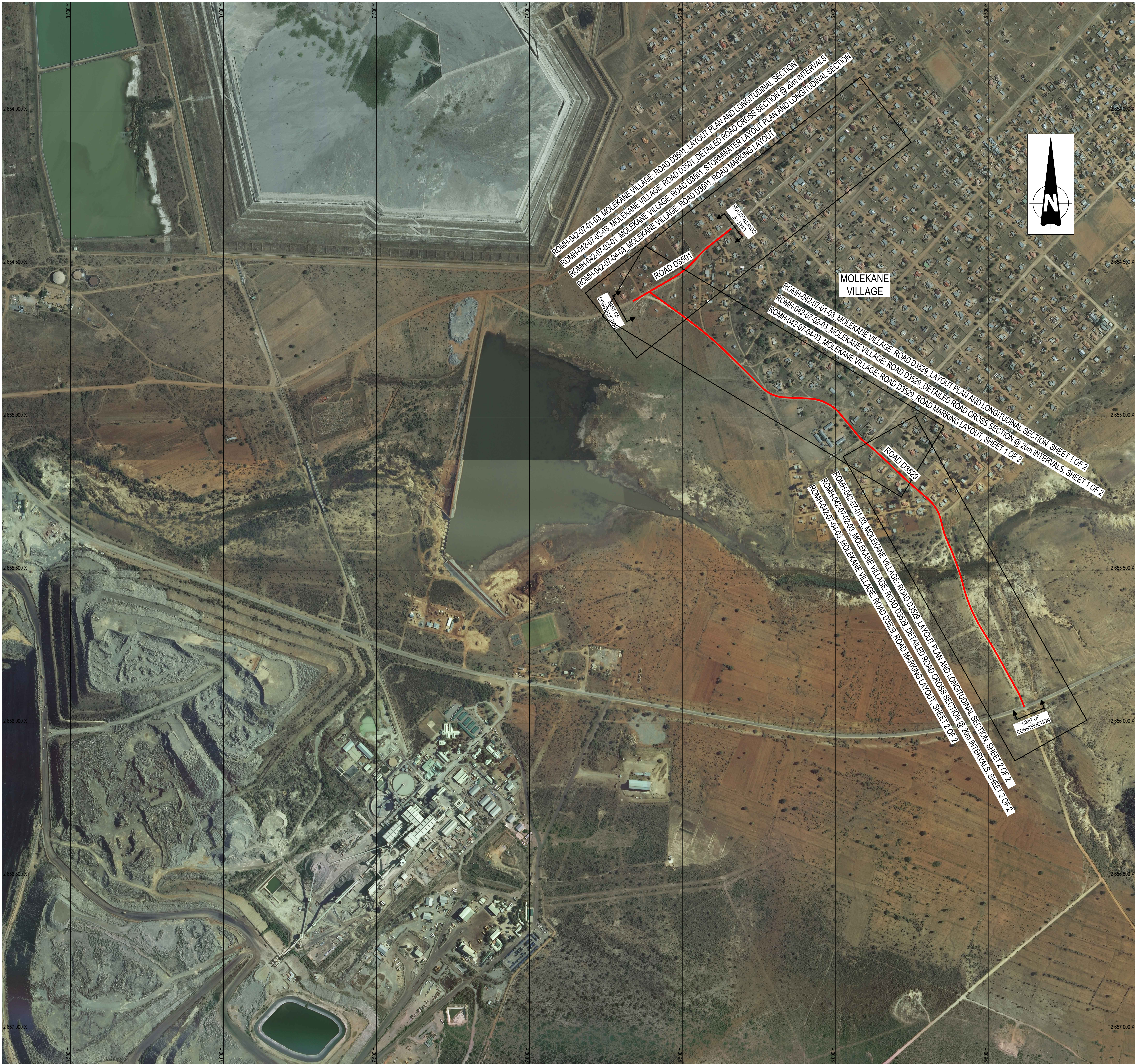
MOLEKANE VILLAGE KEY PLAN SCALE 1:5000